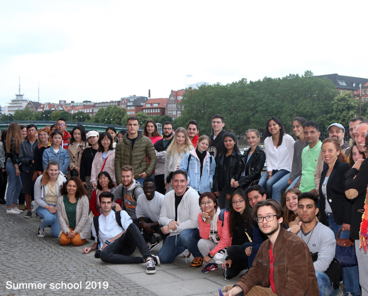
Summer school 2019

Learn German with the University of Bremen